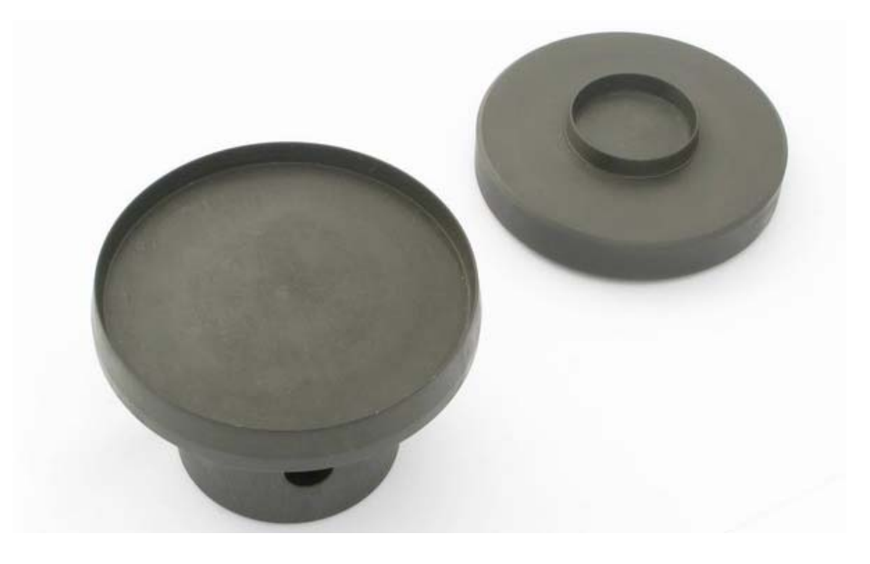
GC1499 Ring on Ring Fixture

G747-C1499 is designed to be used with a universal compression testing machine to determine the flexural strength of advanced ceramics, as specified by ASTM C1499.